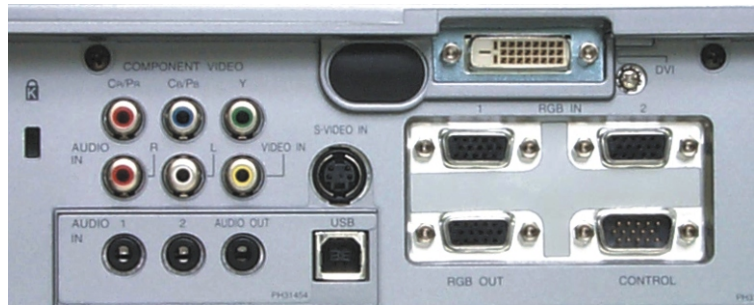
The ImagePro 8910 inputs are easily accessible.

If you are looking for a versatile projector to handle the classroom, training room, conference room, halls or churches, the XGA ImagePro™ 8910 is the projector for you. Bright enough to handle demanding, large audience presentations, yet small enough to easily carry around. The 8910 has a wide set of features that will satisfy virtually every user. In addition innovative new features such as Horizontal and Vertical Keystone correction plus a "Custom Image" programable startup screen further increase the usefulness.